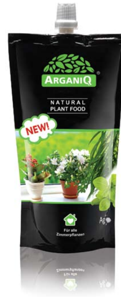
Natural plant food 1 kg

When it is time to transplant or repot your plants, apply AgraniQ onto the roots. Press the container once, and your plant will cheer you up with its healthy and flourishing looks for several months. It is as simple as ABC, and it always comes to good.