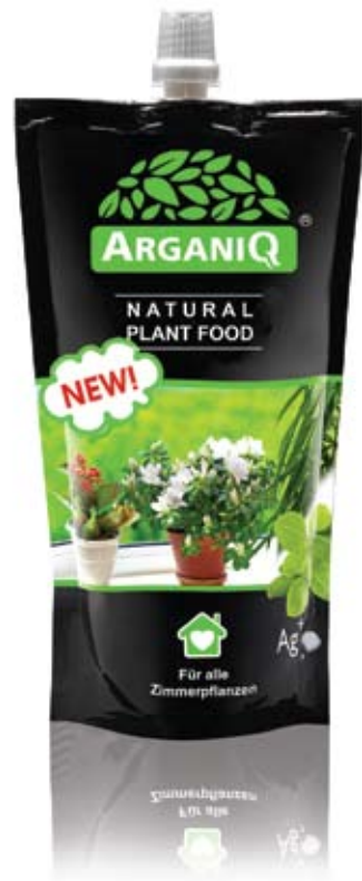
Natural plant food 0,5 kg

VPE 30 Palette 960 (32x30) EAN code 4670001890014